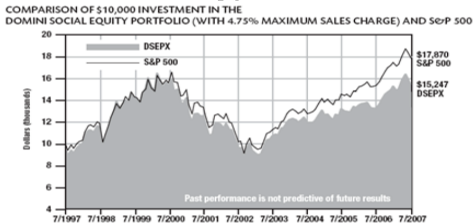
Figure 7: Domini Social Equity Fund’s performance against the SP&500.

Under the Index, Domini Social Equity Fund performed reasonably well in the 1990’s, against its benchmark, the Standard & Poor 500. BusinessWeek reports that strong growth during this period can be attributed to the socially responsible profile of the technology sector in which the Fund was heavily invested in. However, fund performance has been middling since the internet bubble burst in the early 2000’s, particularly since the fund’s screens out high-performing energy, utility, and industrial sectors for their negative environmental records. 16 Refer to Figure 7 for Domini Social Equity Fund’s performance against the SP&500. Refer to Appendix E for figures.